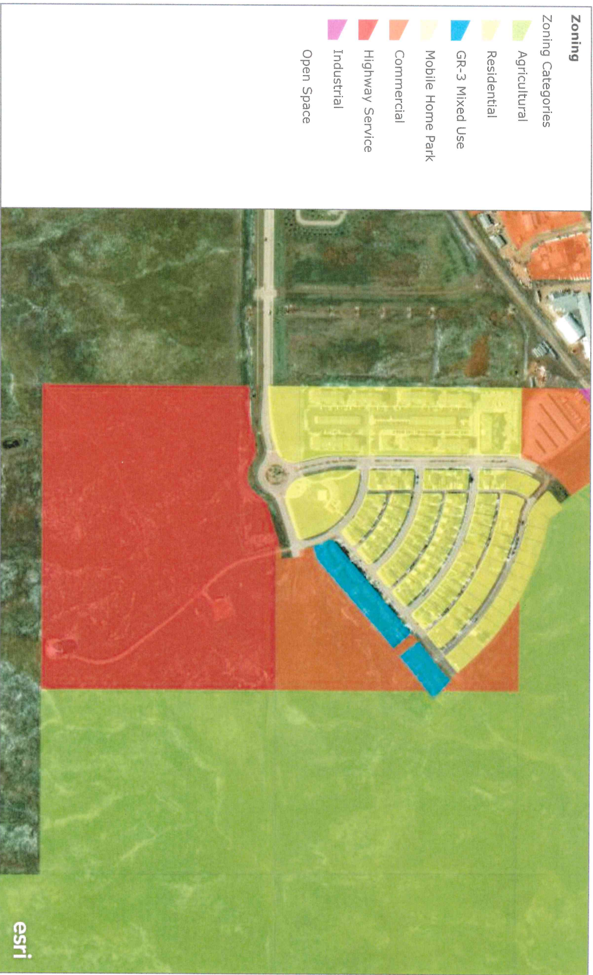
Zoning information for the City of Box Elder